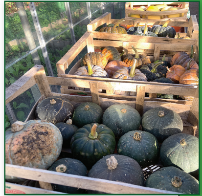
Squash curing in the glasshouse to harden up the skin to improve storage life.

Overall, we harvested 12,662kg of produce and grew over 10,000 food plants that were purchased by local gardeners. As ever, the plants weren't the only stars of the garden: it would have been a less vibrant, less productive place without the volunteers, learners and work placements that make up our wonderful team.